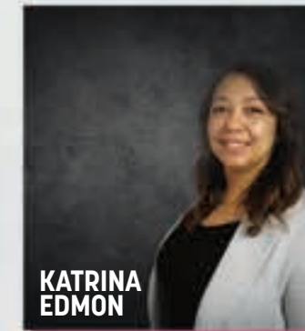
Chief Operating Officer