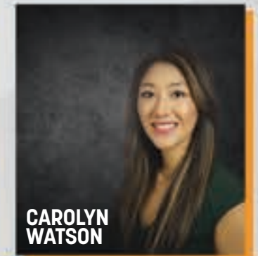
Chief Advancement Officer