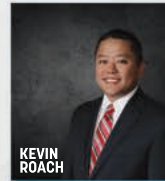
Chief Executive Officer